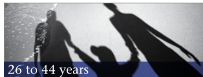
26 to 44 years

When you're juggling work, family and paying off the mortgage, super isn't usually a high priority. But taking a little time to plan for your retirement today will make sure you're in a good position to relax and enjoy a worry-free life when you leave the workforce. Here are a few easy steps you can take to get your super into shape.