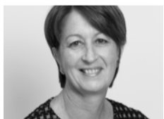
Winsome Hall Trustee (ACTU nominated) Appointed 1 July 1996, reappointed to 30 September 2010