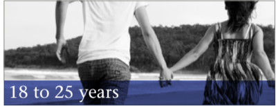
18 to 25 years

While super is usually the last thing on your mind when you're just starting out in the workforce, the decisions you make now can get your future savings off to a really strong start. Here are a few easy steps you can take to start getting your super into shape.